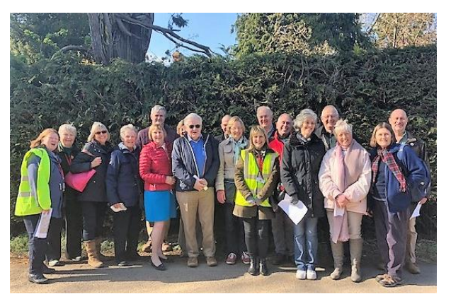
World War 1 estates study day at Luton Hoo Estate

Support us to help understand and enjoy our Bedfordshire heritage.