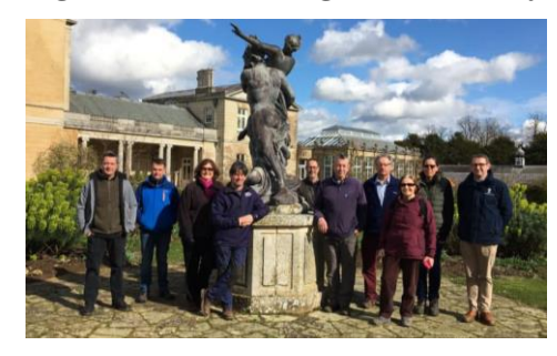
Head Gardeners meeting at Southill Park

We want to work with others to help manage future change positively.